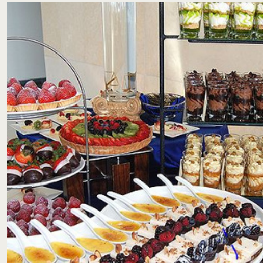
Mini Dessert Assortments