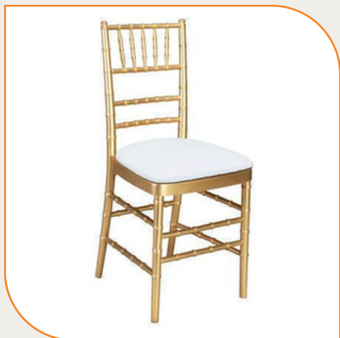
Chiavari Chair - AED 15 Colours : Gold, White