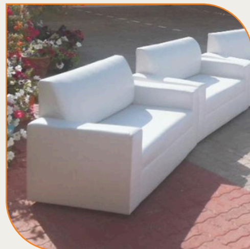
Sofa Set - AED 75 / 150 / 250 Colour : White