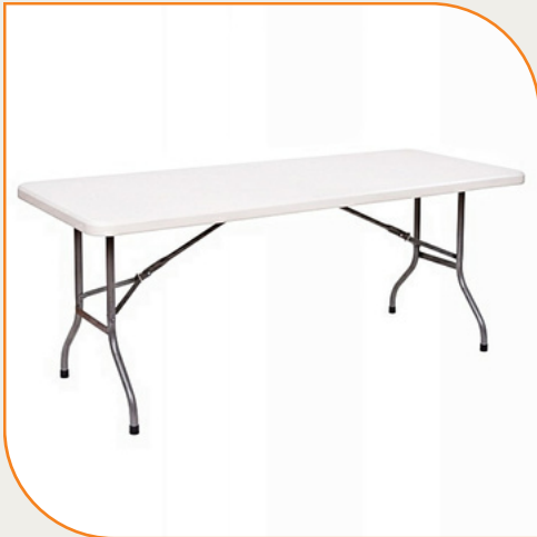
Rectangular Table - AED 50