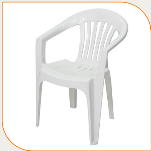
Plastic Chair - AED 3