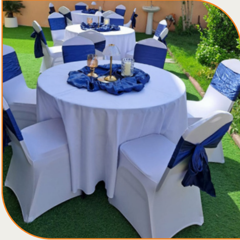
Round Table - AED 35 4 - 8 Seater