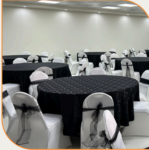
Round Table - AED 50 8 - 12 Seater