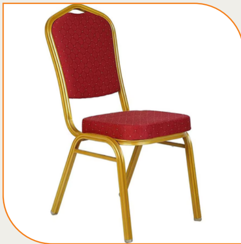
Plain Chair - AED 5