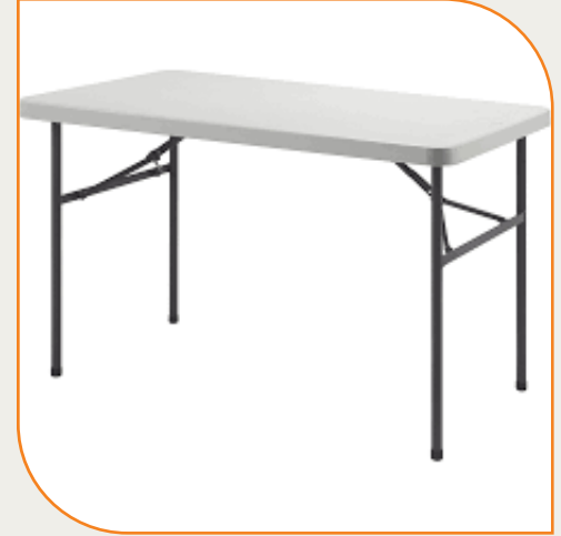
Rectangular Table - AED 35