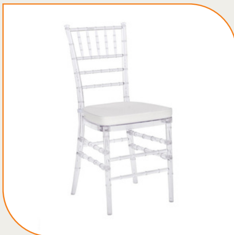
Acrylic Chair - AED 18