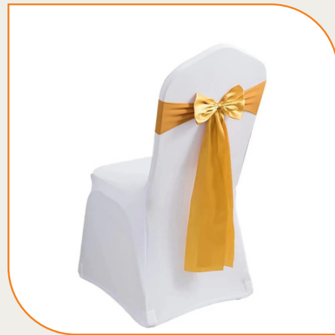
Stretch Fabric & Bow - AED 7 Bow Colours : Black, Gold, White, Blue