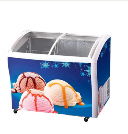
Ice Cream Station